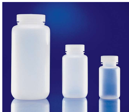
Wide Mouth, Natural