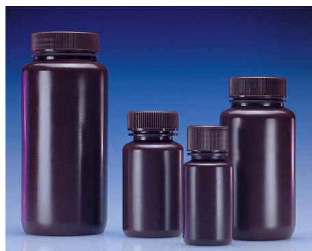
Wide Mouth, Amber