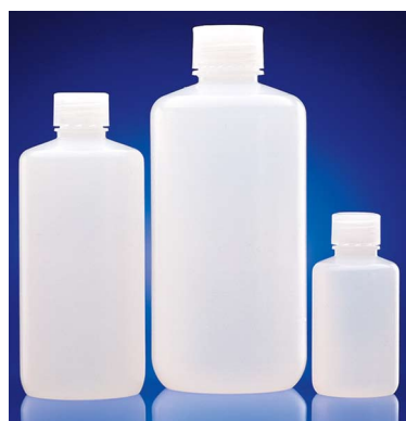
HDPE, Natural PP, Natural